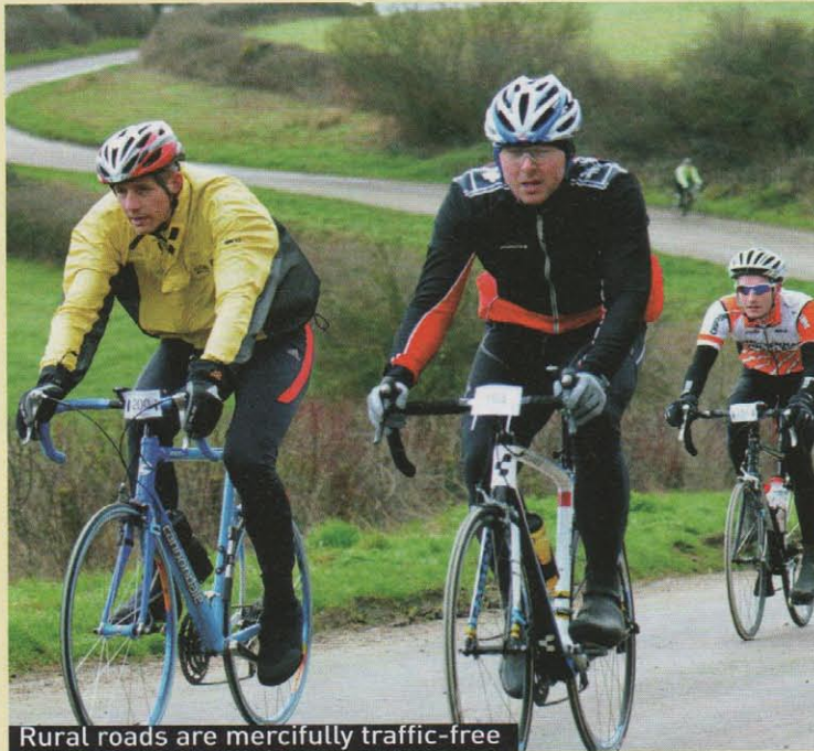
Rural roads are mercifully traffic-free

Starting out from Blandford Forum, riders headed off in an anti-clockwise direction and were soon into the quiet back lanes and pretty villages of rural