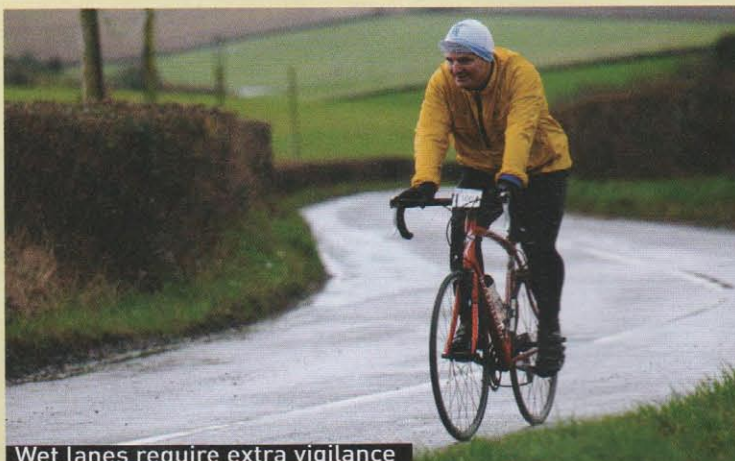
Wet lanes require extra vigilance

"A GREAT route with a good balance of undulating and flat terrain and some tough climbs, especially the last two about 20 miles from the end. The pies were great."